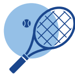
BOYS & GIRLS TENNIS