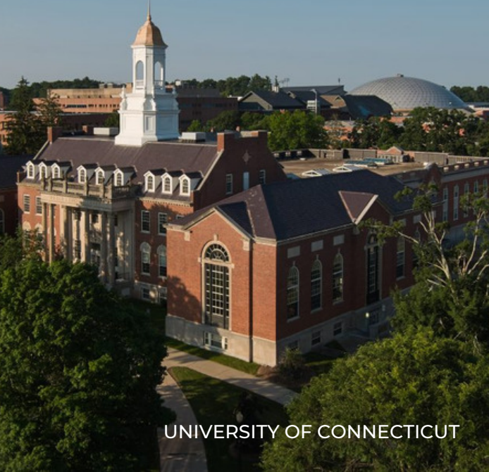
UNIVERSITY OF CONNECTICUT