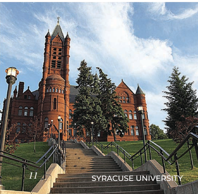
11 SYRACUSE UNIVERSITY