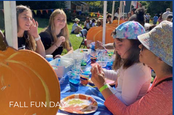
FALL FUN DAY