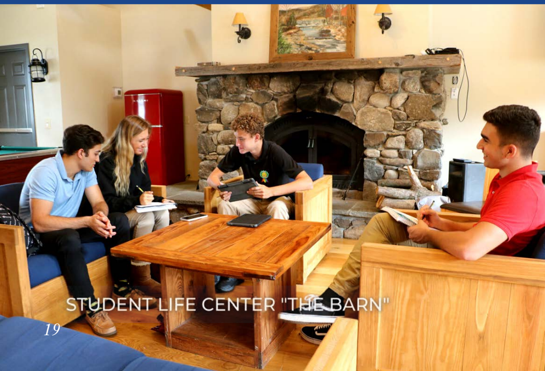
STUDENT LIFE CENTER "THE BARN"