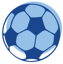
BOYS & GIRLS SOCCER