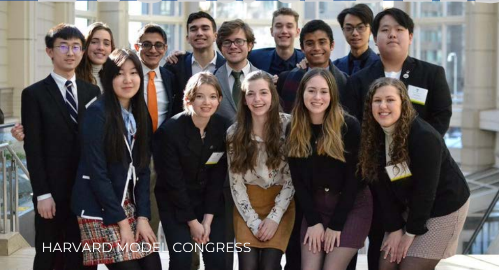
HARVARD MODEL CONGRESS