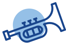
4TH & 5TH GRADE BAND