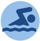
BOYS & GIRLS SWIMMING